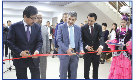
Opening of the Islamic Finance Centre