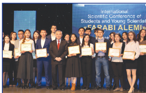
Conference of students and young scientists «Farabi alemi»