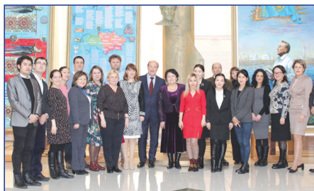
Coordination Council of the Erasmus + ENINEDU Project