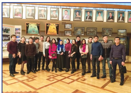
In the theater named after M. Auezov

There are following students' self-government organizations: Council of Students, the Maslikhat of Students, and "Sunkar".