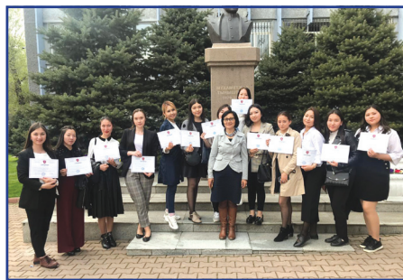
Students' subject Olympiad