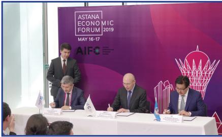
Tripartite memorandum between Al-Farabi KazNU, AIFC and Hamad Bin Khalifa University (Qatar)