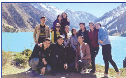
Big Almaty Lake