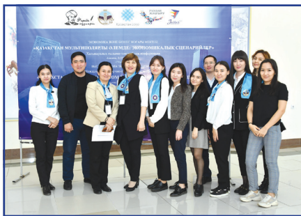
International Scientific Conference