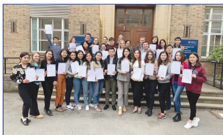
Scientific internships for master students at Oxford University (UK)