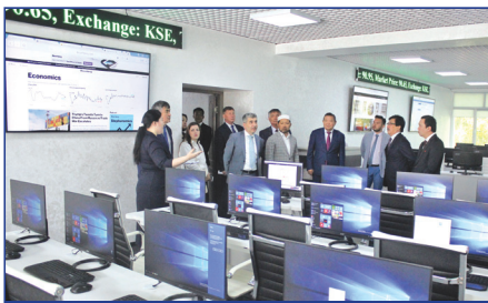
Stock Market Technologies Centre