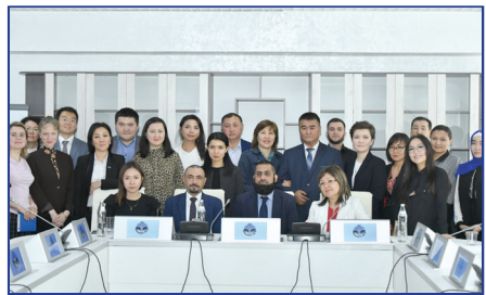
Seminar held jointly with AIFC and representatives of Qatar and Bahrain