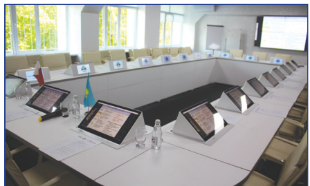
Conference Hall of the Business Competency Development Cluster