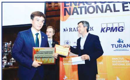
Student Entrepreneurship – Enactus World Cup (Canada)