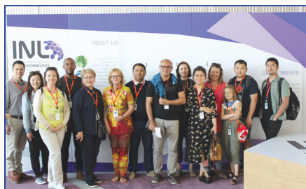
Seminar at the University of Santiago de Compostela (Spain)