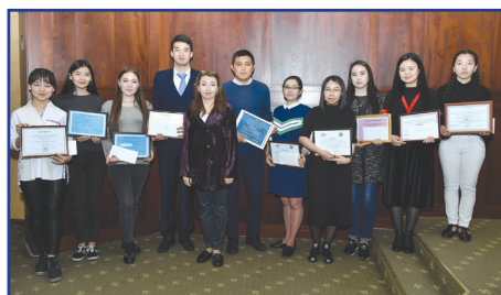
Scholarships for gifted students