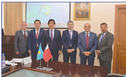
Cooperation with Hamad Bin Khalifa University (Qatar)