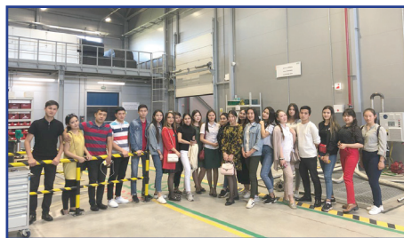
Internship at the company "Damu Logistics"