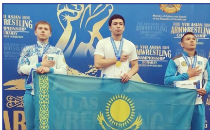
Our victories in sports