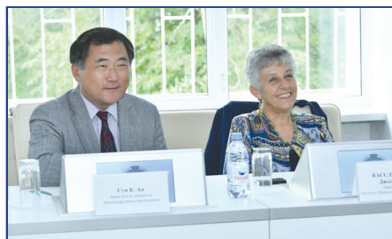
Cooperation with Washington State University (USA)