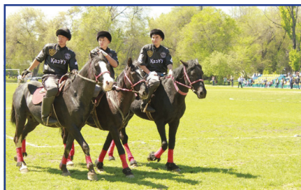
National game «Kokpar»