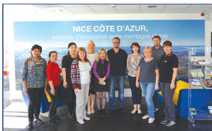
Seminar-training at the University of Nice – Sophia-Antipolis (France)