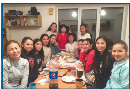
Warm evenings at the dormitory