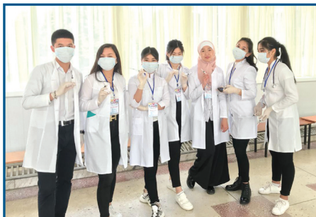
Break between classes...