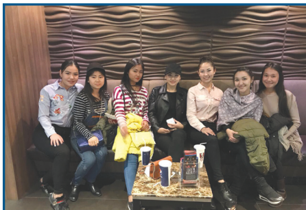
After watching the movie «Student»