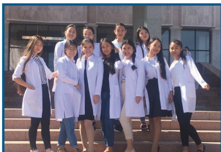
Unforgettable student time ..