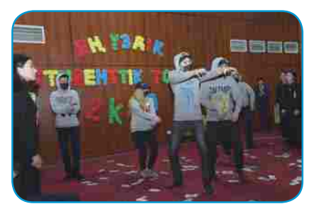
Best student group

Student life at the faculty is very interesting, since the faculty has 9 organizations of student self-government. For example, the Union of students and undergraduates «Sunkar», «Student Council», the organization of «Student Bureau of Bologna process», «Student Maslikhat» and other organizations.