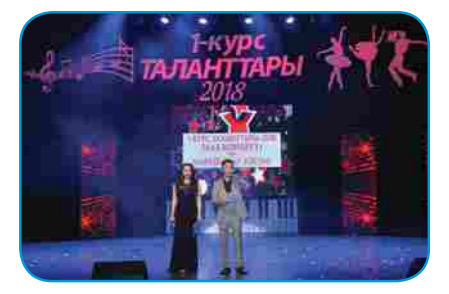
Show of Talents 1 course