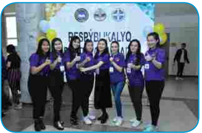
Republican Subject Olympiad