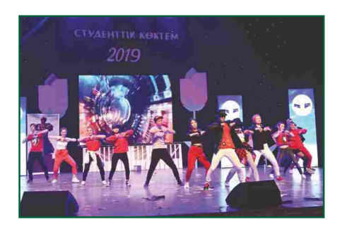
Festival "Student Spring»