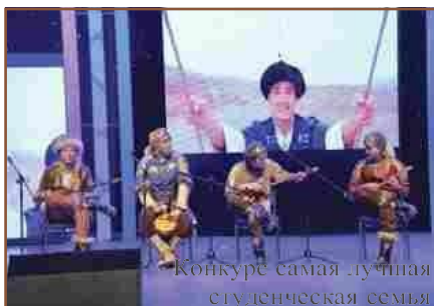
Конкурс самая лучшая студенческая семья