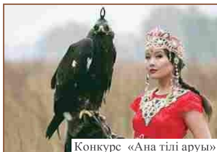
Конкурс «Ана тілі аруы»