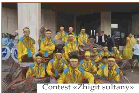
Contest «Zhigit sultany»