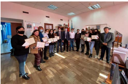
Meeting with famous personalities