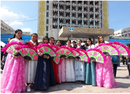
Traditional fan dance of the East

Organizations of student self-government operate at the faculty: Student Council, Student Maslikhat and Students' Trade Union "Sunkar". Nonresident students are provided with a dormitory.