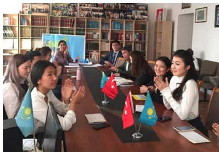
Debate during class