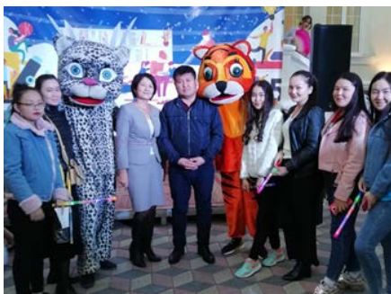
Walk with students

Based on the results of the course, certificates are issued