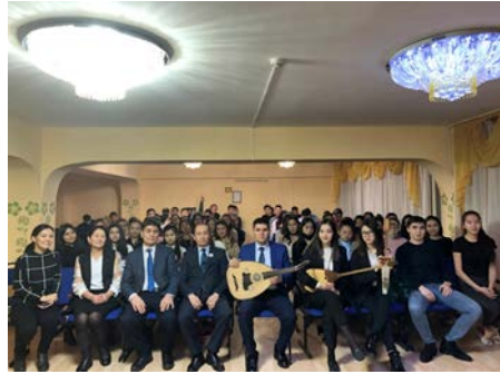
Concert in the dormitory