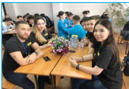
Republican contest «Criminalist - Expert»

In addition to the academic training of students, the Faculty focuses on the development of a full-fledged person in society. It is proved by student organizations such as the "Legal Clinic", the "Student Council", the "Senate of Students", the "Sunkar", the "Komek" and the traditional social-educational activities.