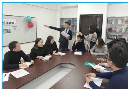
Intellectual game «Let's brainstorm»